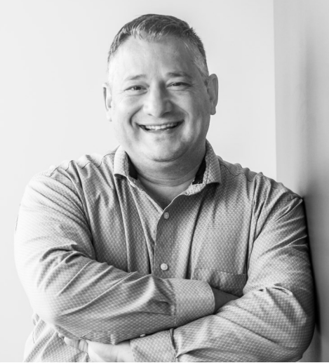
"As a business owner, I know you don't have time to waste on technical and operational issues. That's where we shine! Call us and put an end to your IT problems finally and forever!"