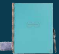
Buy it here: Rocketbook Reusable Smart Notebook

Write your thoughts, scan them and then erase the pages for reuse. This cycle keeps your notes organized and searchable on your device while conserving paper. By offering a reusable alternative to traditional notebooks, Rocketbook stands out as a practical, eco-friendly solution for capturing and organizing your bursts of creativity!