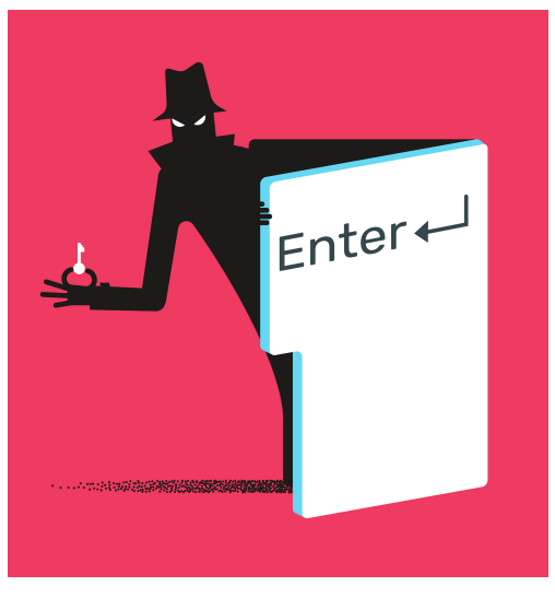
You Know The Saying: If It Sounds Too Good To Be True, It Probably Is

How to prevent it: Ensure you're eligible for the Canada Carbon Rebate, as incorrectly claiming it could lead to serious consequences. Always consult a qualified tax professional to ensure your claims are legitimate.